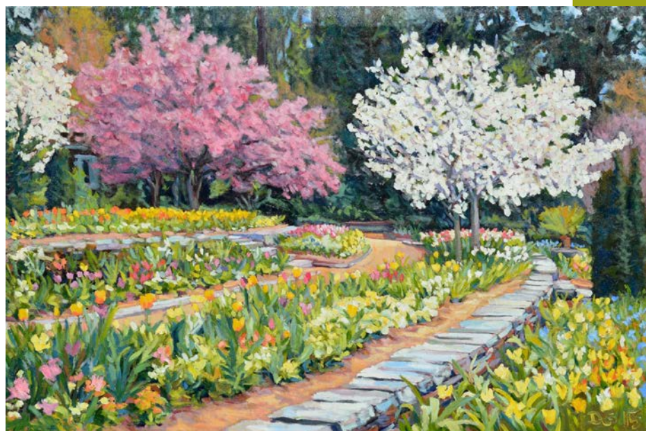
Duke Garden in Spring, 24" x 36", Oil on canvas

For more information, visit artsandhealth.duke.edu or call 919.684.6124